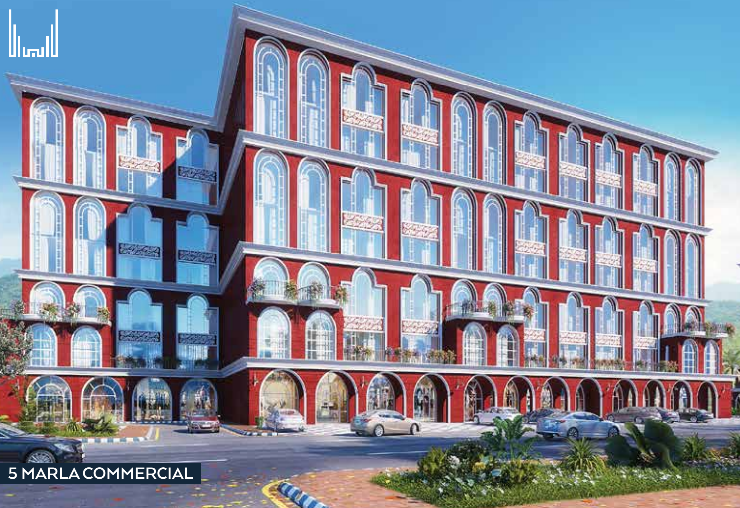
5 MARLA COMMERCIAL